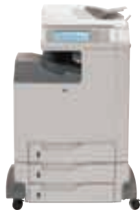
HP Color LaserJet 4730x mfp