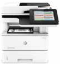
HP LaserJet Enterprise MFP M527f