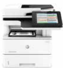
HP LaserJet Enterprise MFP M527dn

Finish key tasks faster with an MFP that starts right away and helps conserve energy. 1 Multi-level device security helps protect from threats. Original HP Toner cartridges with JetIntelligence and this printer produce more high-quality pages. 2