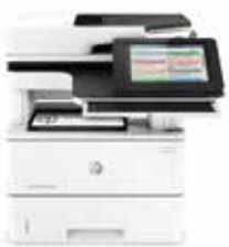
HP LaserJet Enterprise Flow MFP M527z